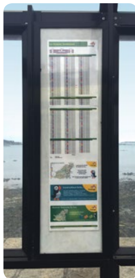
▲ The flexibility of Omnistopdesign has been key for CT Plus Guernsey