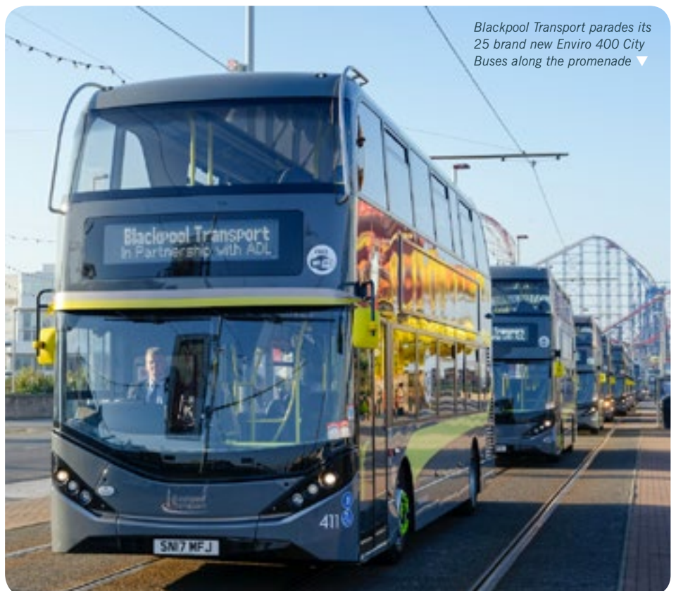
Blackpool Transport parades its 25 brand new Enviro 400 City Buses along the promenade ▼

Blackpool is in the process of introducing myDAS Touch, the Omnibus driver app, which should be up and running by the time delegates gather at the ALBUM conference in May.